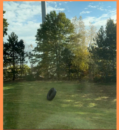
Mrs. Cole was filming the beauty of the fall foliage when suddenly a tire rolled past!