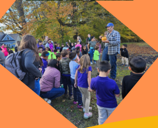
P-2 field trip to George Hill Orchards to pick apples