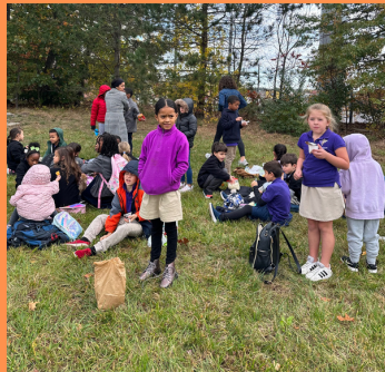
Students enjoying their snacks while they await instructions