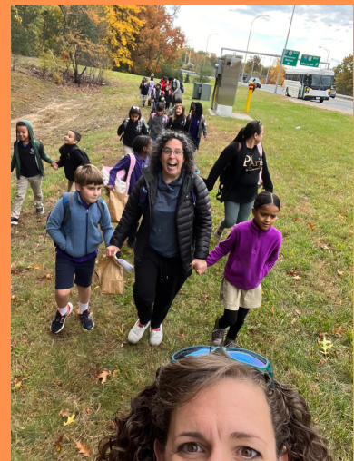
Walking to the nearby Raddison, with police escort