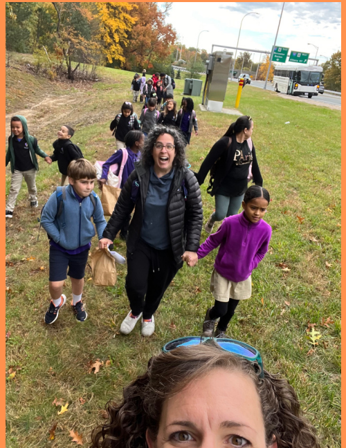
Second grade's adventurous field trip... see more on page 4