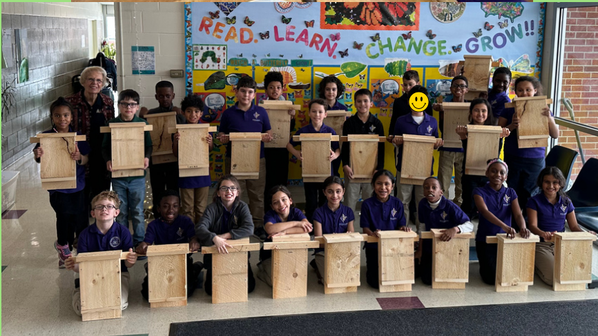
3rd and 4th Grades went to the Norcross Wildlife Sanctuary and made bat houses!