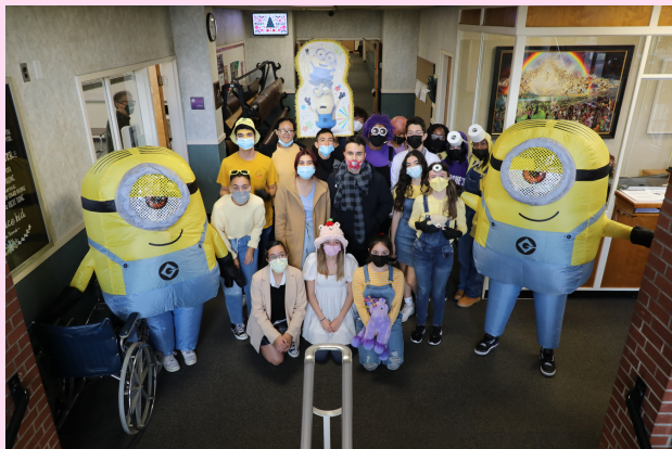
Here are some shots from this year that didn't make it into earlier newsletters!