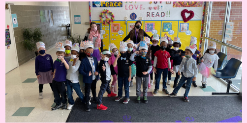
Cheerios celebrated 2-2-22 by wearing ties and tutus!